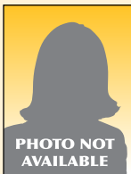
Suze Orphee Taxi Customer Service Agent